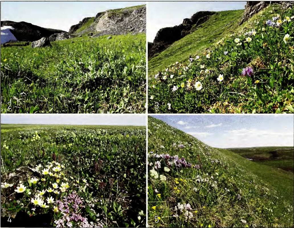
Figs 2–5. Examples of habitats near Amderma. 2. Alpine meadow near small river. 3. Alpine meadow on south-facing slope. 4. Willow- Dryas tundra. 5. Meadow on sandy soils, with a bog behind.